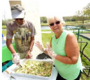
The salad masters!