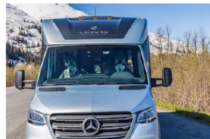
Even the pets get in on the action!