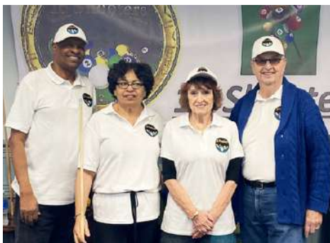
16 Shooters Directors