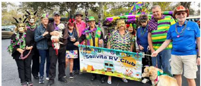
RV Club cast of characters at the Mardi Gras Parade.

RV Club members have been on the go so far in 2024 exploring new locations. Back home, we participated in the Solivita Mardi Gras Parade as well as a potluck dinner. Upcoming events include our April Rally at Creekfire RV Resort in Savannah, GA, a “pre-rally” in St. Augustine, and our annual pre-Christmas rally, returning to Fisherman’s Cove in Palmetto December 4th-7th. Our members generously share their knowledge, expertise, tips, and techniques with each other. We encourage RV owners to check us out at our meetings on the 3rd Wednesday at 4:30pm in RSF2 or visit us at SolivitaRVClub.org.