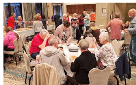
Brooklyn Fun Club Valentine's Dinner