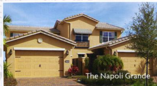
The Napoli Grande

A two-story floor plan that lives like a one-story with three bedrooms, two and a half baths, great room, loft, office/hobby room, den/media room, one-car garage with golf cart bay