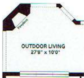
Optional Outdoor Living w/ Fireplace