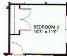
Optional Bedroom 3 ILO Flex