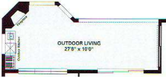
Optional Outdoor Living w/ Outdoor Kitchen and Fireplace