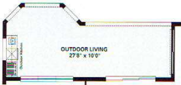
Optional Outdoor Kitchen w/ Outdoor Kitchen