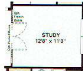
Optional Study ILO Flex