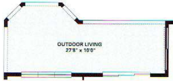
Optional Outdoor Living