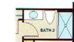
Optional Shower ILO Tub at Bath 2