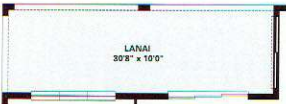
Optional Extended Lanai