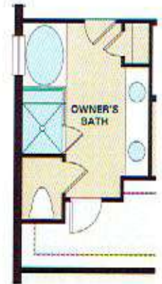
Optional Deluxe Owner's Bath