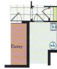
Opt. Laundry Tub at Garage